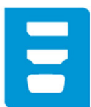
Displayport, HDMI, VGA